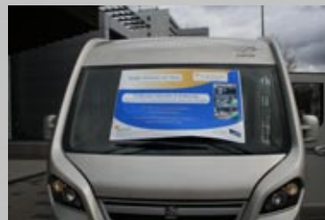
A poster is showing "Endo-Trainer on tour"