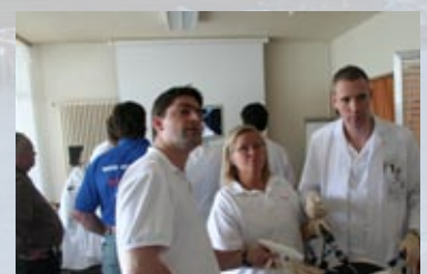
Clinical training group in action