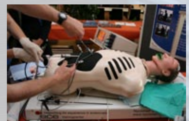
Endo-Trainer for Minimal Invasive Surgery