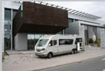
Starting from the ECE-Base in Erlangen to a workshop location