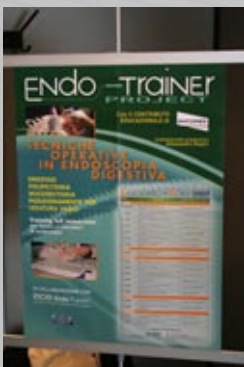
Italy 2007 as an example of an Endo-Trainer Tour

Convenient if a couple of dates can be combined on a tour, or if more than the normal two models are requested for a course or congress.