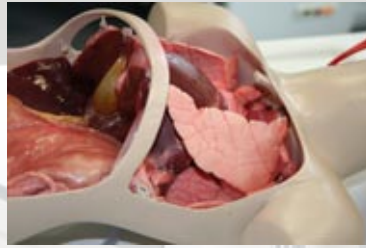
Thoracic and abdominal organs implanted