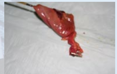
Preparation of the gallbladder