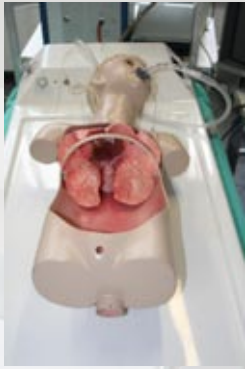
EndoPaed-Trainer (size of a five year old child) lung ventilated