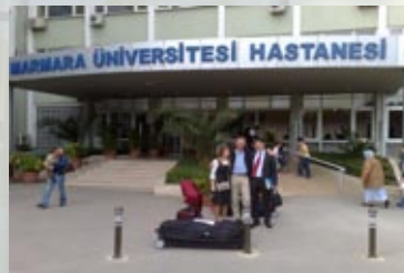
Two Endo-Trainer models packed up in two special bags