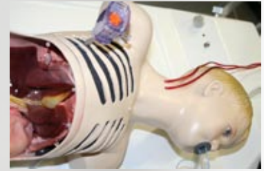
Perfusion system connected