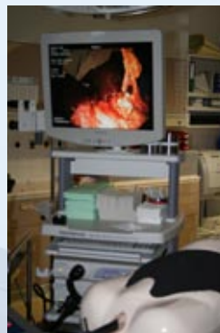
Clip on the bile duct