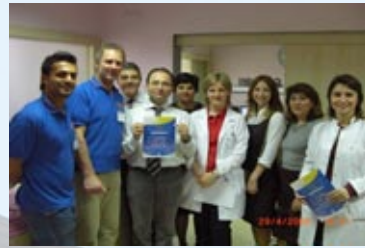
Happy participants after the course