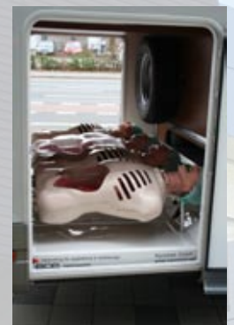
Up to 4 Endo-Trainer models on board