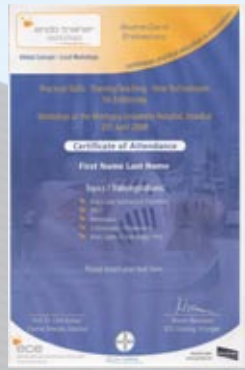
Example of a certificate that was recently used on a course in Turkey

Score-Card Endoscopy as a quality based system to prove competence and learning progress in Endoscopy.